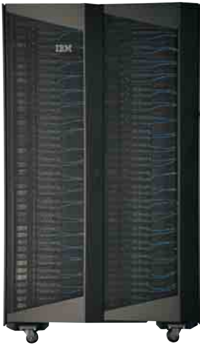
iDataPlex technology delivers innovative design for optimized density in the data center.

used to actually cool the room—helping reduce or even eliminate the need for air conditioning in the data center 2 . Using an iDataPlex solution with the Rear Door Heat eXchanger could mean the difference between keeping data center costs under control or seeing them skyrocket.